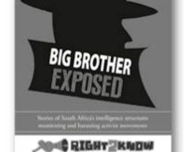
Find them at r2k.org.za/publications