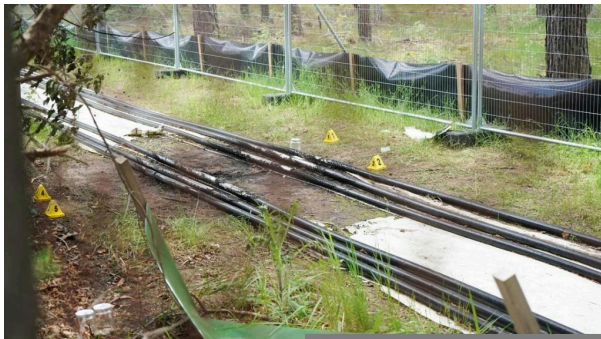
Six high-voltage cables supplying power to the site of a Tesla “gigafactory” were torched near Berlin, Germany in May 2021. Translated from the communique 24 : “Our fire opposes the lie of the ecological car”.

many levels: the network of charging stations is vulnerable to sabotage 22 , the vehicle lots and buildings can be attacked, and the cars themselves can be easily damaged or destroyed 23 .