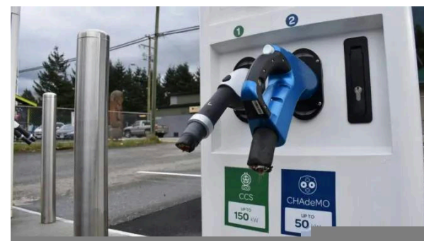
Electric vehicle charging station with severed cables.

a smartphone app. Other companies are not far behind, teasing features that are similar to Tesla's sentry mode.