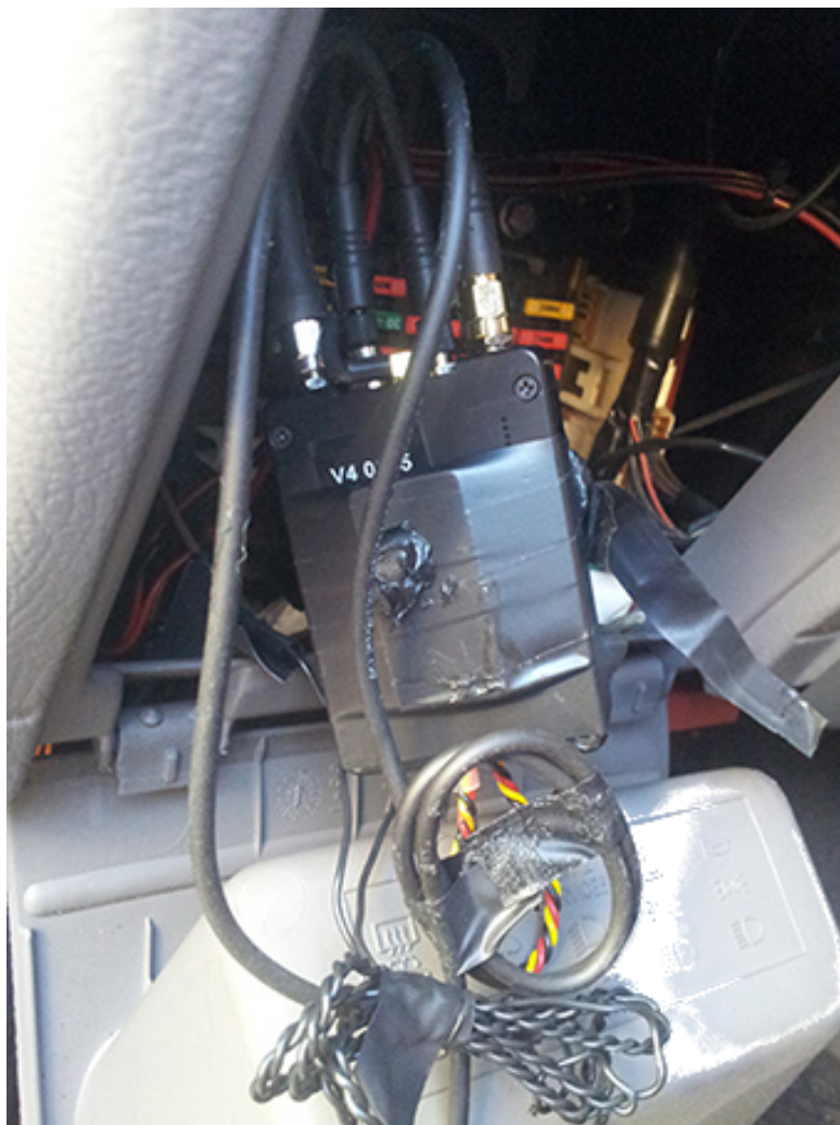
Microphones and a GPS tracker found in the fuse box of a car in Lecce, Italy, in December 2017 2 .