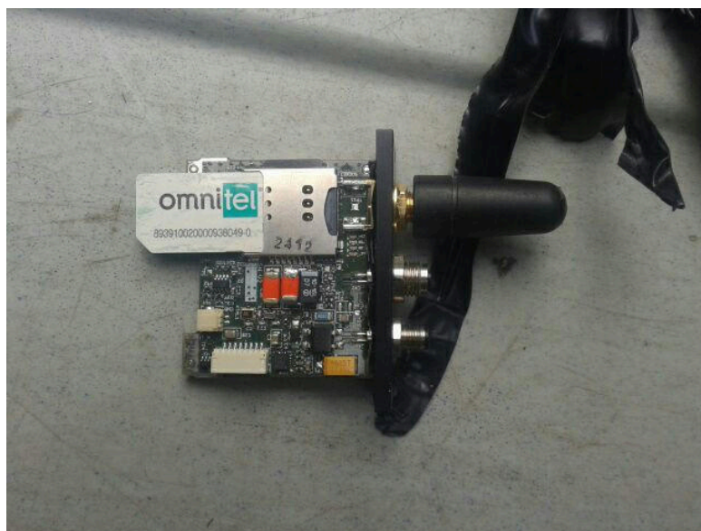
A device equipped with a SIM card found in a vehicle in Italy, in August 2019 5 .