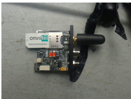
A device equipped with a SIM card found in a vehicle in Italy, in August 2019 5 .