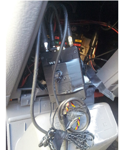
Microphones and a GPS tracker found in the fuse box of a car in Lecce, Italy, in December 2017 2 .