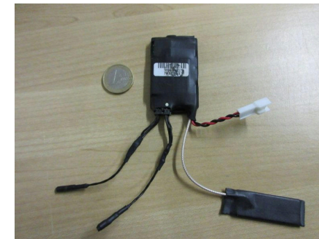
Microphones found inside a power outlet in a building in Bologna, Italy, in January 2018 1 .

Hidden physical surveillance devices are typically used by law enforcement and intelligence agencies to obtain information about a target when traditional surveillance methods are insufficient. For example, if a suspect never talks about sensitive topics on the phone—making the monitoring of their phone useless—law enforcement may resort to installing a hidden microphone in the suspect's home, in the hope of capturing interesting conversations. In many countries, the installation of such devices is regulated by law and must be approved by a judge.