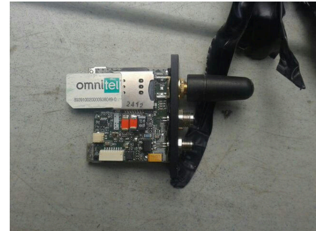
A device equipped with a SIM card found in a vehicle in Italy, in August 2019 5 .