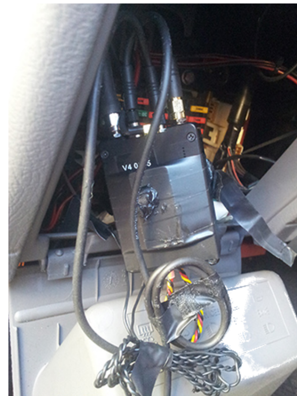
Microphones and a GPS tracker found in the fuse box of a car in Lecce, Italy, in December 2017 2 .