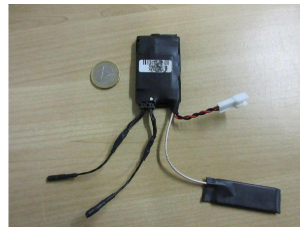
Microphones found inside a power outlet in a building in Bologna, Italy, in January 2018 1 .