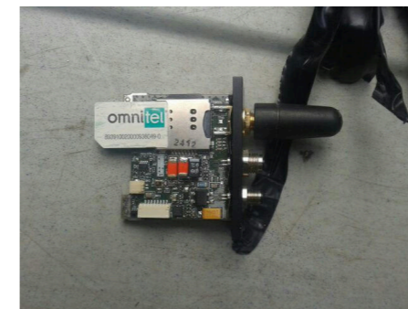
A device equipped with a SIM card found in a vehicle in Italy, in August 2019 5 .