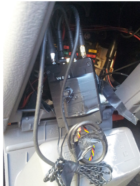
Microphones and a GPS tracker found in the fuse box of a car in Lecce, Italy, in December 2017 2 .