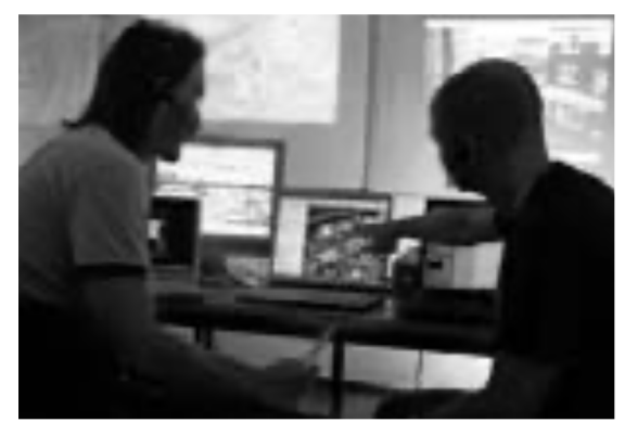
MEK officers planning operations.

A surveillance team conducts team meetings every week. New cases are presented and the surveillance plan is developed. Who leads the surveillance squad on site, the squad leader or a subordinate official? How many people and cars are used for the case, which working hours and how many days are reserved, which technical means are