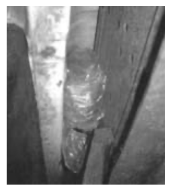
Tracking module attached to the underside of the vehicle in a cavity. It is wrapped in plastic to protect it from splashing water. In winter, packaging also increases the service life of the battery (protection against discharge through cold).

Surveillance, according to Section 100 of the Code of Criminal Procedure (§100 StPO), is usually implemented very quickly after the judicial decision. In particular, telecommunications surveillance (TCS), which includes telephone monitoring and all online activities such as email, internet, etc., can be set up without any difficulty. Most commercial providers only need a fax or, in the case of "imminent danger", a call from the investigating authority to fulfill their legal obligation to activate surveillance. Other areas of §100 StPO