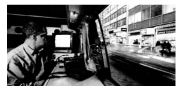
Official inside a camouflaged van (elevated position). The large window on the right is mirrored or heavily darkened.

Ultimately, the basic aim of police surveillance is the conviction of offenders and the conviction of the target by a court. If this seems