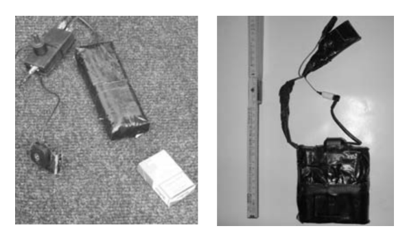
Left: GPS transmitter from the LKA Schleswig-Holstein (2007), GPS antenna and battery set separately.

though this is a little more complex because there are only a few possible hiding spots. It is very difficult with bicycles because they can only be concealed in the frame, which is not very promising due to the shielding effect of the metal. Alternatives could be a permanently installed lighting system such as the dynamo (electrical generator for bicycles employed to power a bicycle's lights) and plastic parts with cavities such as reflectors and lighting. For a target, however, it is very possible to quickly examine a bicycle for foreign objects.