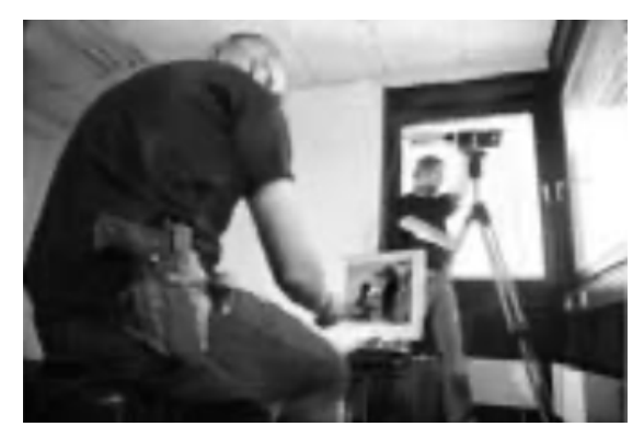
MEK officers working in a conspiratorial apartment.

Cars with hidden/camouflaged cameras in an otherwise open interior are less conspicuous, but have the disadvantage that the camera has to be realigned to the target after each time the vehicle moves. Such cars are therefore used for recording the comings and goings at a fixed destination over a long period of time. The issue of storage capacities and battery power arises here, especially in the cold of winter, which is why such vehicles have to be regularly serviced. Usually, a stationary camera is positioned as close as possible to the target property in order to avoid any obstructions to the line of sight. Only when there is no alternative is a camera vehicle parked on the other side of the street, because traffic flows significantly obstruct the desired viewpoint and nobody is present to bridge gaps in surveillance.