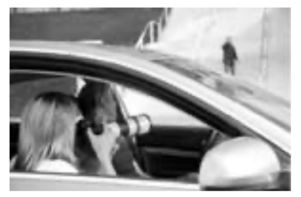
MEK officers on surveillance duty.

In every crime film we see a suspicious person driving away in a car and the policeman who is following them immediately pulling their car out ten meters behind to initiate the pursuit. In reality, this is, of course, completely impractical because the target could notice it. When the "target vehicle" (TV) starts to move, the vehicle in the A-position stops and waits while another vehicle from a greater distance follows. There is almost always enough time between the target getting into the car and driving off to bring another surveillance vehicle into position. Sometimes the vehicle even sits in front of the TV and allows the TV to overtake it once.