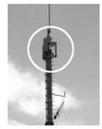
TETRA antenna (very similar to cellphone antennas; three antennas are a characteristic feature).

Some facts about "Terrestrial Trunked Radio": TETRA is a digital radio process, created by an international consortium of companies based in Rome. With its takeover in Germany and other EU countries, TETRA will presumably establish itself as a Europe-wide digital standard.