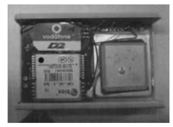
Inside view of a GPS tracking module. At the top left the GSM card for transferring data via cellular network.

Secondly, preventive surveillance that is not directed against a specific target. During every major police operation, civil reconnaissance forces observe the environment and potential dangers of a demonstration or football game, etc., whereby individual "officially known" persons are also observed and sometimes followed for longer. Various departments cooperate here and communicate with special control centers, whose findings flow together through the management team. During large-scale operations such as May 1st in Berlin, more than 100 undercover vehicles from police departments to the riot police to the MEK can be used for surveillance. There is also pre-