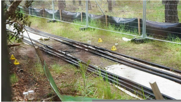
Six high-voltage cables supplying power to the site of a Tesla “gigafactory” were torched near Berlin, Germany in May 2021. Translated from the communique 24 : “Our fire opposes the lie of the ecological car”.

many levels: the network of charging stations is vulnerable to sabotage 22 , the vehicle lots and buildings can be attacked, and the cars themselves can be easily damaged or destroyed 23 .