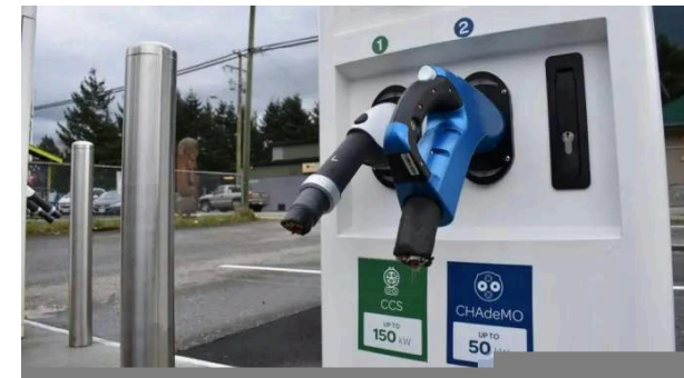
Electric vehicle charging station with severed cables.

a smartphone app. Other companies are not far behind, teasing features that are similar to Tesla's sentry mode.